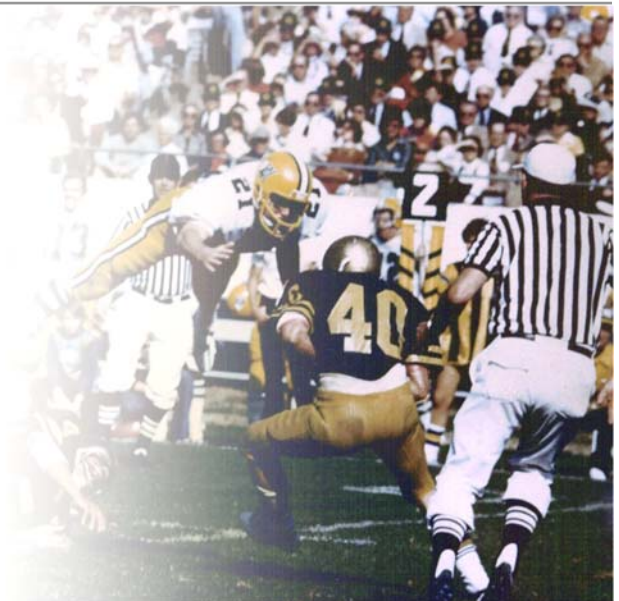
William & Mary vs. Navy, 1976